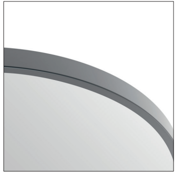
OP opal diffusor