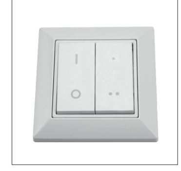
XCS wireless switch